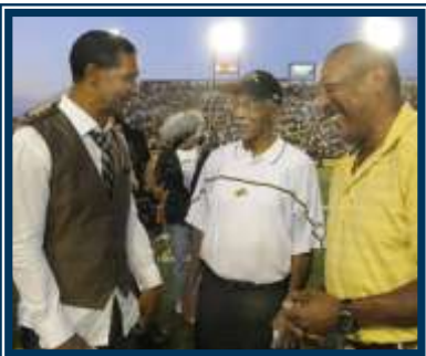
Former Hall of Fame QBs

Damon Allen, Bernie Custis & Chuck Ealey