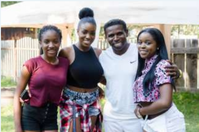
Can you believe these young ladies are Pinballs daughters? Weren't they just in diapers?