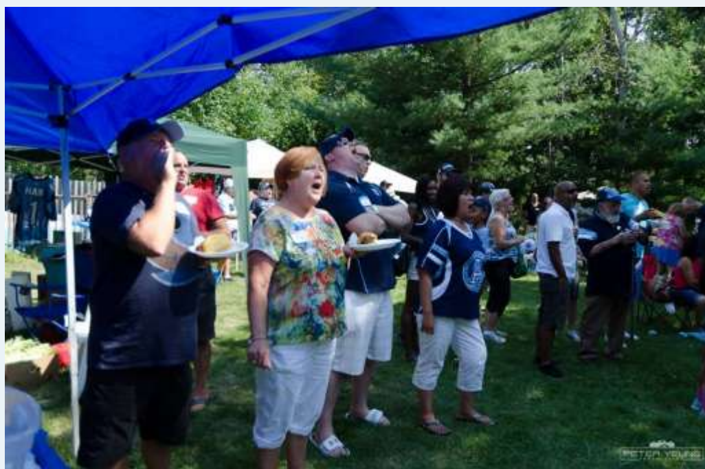
Take one guess what these Argos fans are chanting.....