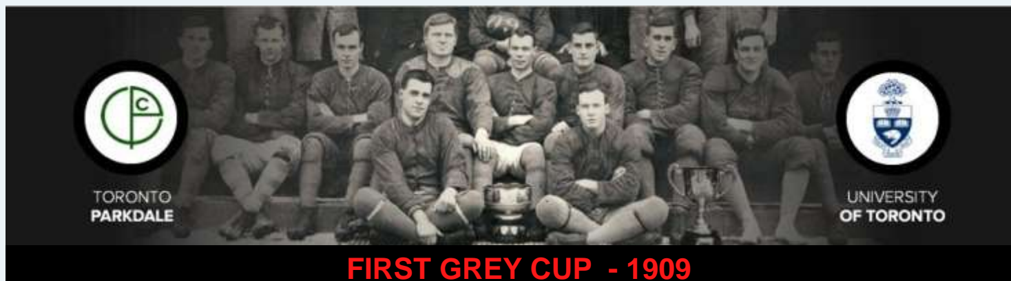
FIRST GREY CUP - 1909