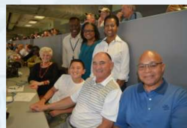
Argos Alumni get together