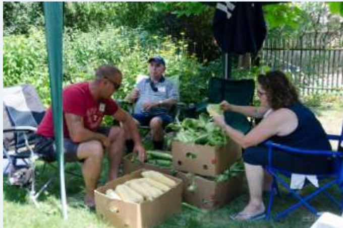
There really is corn at the corn roast